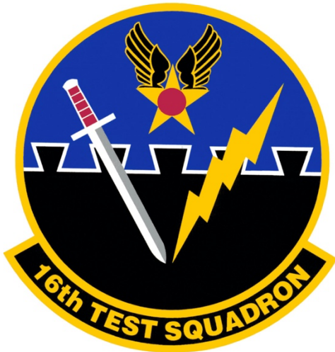
16 Test Squadron emblem approved, 4 Aug 1995